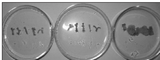
tact = 60 min tact = 30 min Control The effect of MRET water on the growth of kallus tissue (mutated psoriasis cells of botanical origin)